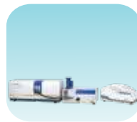
Laser Particle Size Analyzer